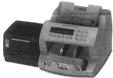
Shown with optional thermal printer

Power: Voltage operating ranges are either 105-130v or 198-253v. Frequency is 60/50Hz. Customer must provide an electrical supply properly grounded and protected by a circuit breaker in accordance with applicable electric code. Power consumption (full load amps) at nominal voltage: 0.6 amps (120v); 0.3 amps (220v). Power conditioning/stabilizing devices are available through Cummins Allison.