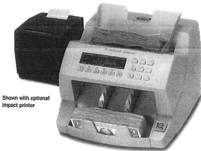
Shown with optional impact printer

Print detailed or summary reports on our compact thermal or impact printers. Many reports can be automatically printed as you process currency, or you can print them on-demand only when you want them. Printed reports give you a physical record of your counts that you can store or process further.