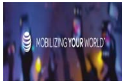
image001.png 89 KB

Scan Date: 10.27.2015 11:42:13 (-0500) Queries to: PCT4Admin@co.hidalgo.tx.us