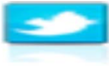
image002.png 1 KB