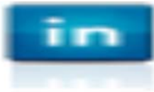
image003.png 2 KB