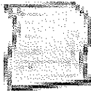
image002.jpg 894 B