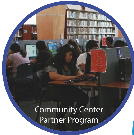
Community Center Partner Program

Our partnership with Texas WorkForce Solutions helping residents search and apply for jobs online.