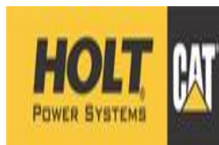
image002.jpg 3 KB