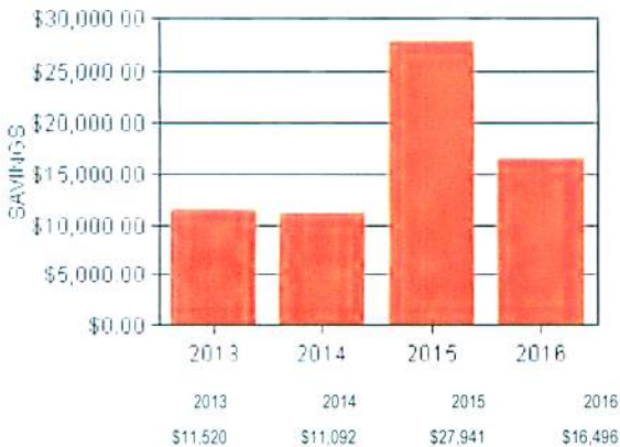
US Communities Estimated Annual Savings

$67,049 Estimated savings since 2013 by using US Communities