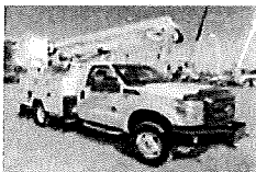
image001.jpg 14 KB