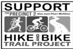
hike and bike logo.jpg 83 KB