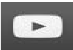
YouTube.png 3 KB