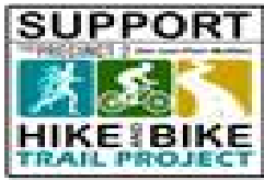
image002.jpg 3 KB