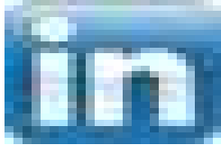
image006.jpg 862 B