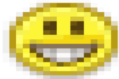
image007.gif 343 B