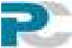
image003.jpg 877 B