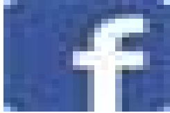
image005.jpg 814 B