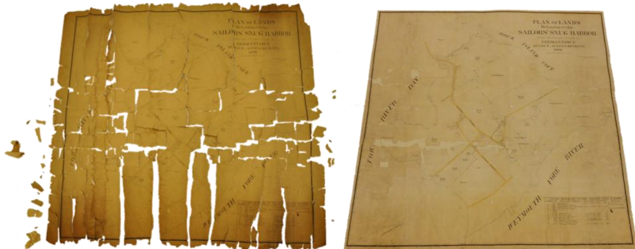
This 1894 map is titled, "Plan of Lands Belonging to the Sailors' Snug Harbor" and is from Quincy, MA. Rolled for years, Kofile performed restoration treatment, pieced back together its fragments, and backed with archival tissue.

can email a working copy image for immediate printing. If not, and a reasonable number of hard copies are required, then Kofile will print and ship the plat directly to the County.