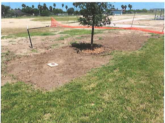
Grass removed | scraped-off during the excavation of the plumbing lines by county crews. Landscaper will not need to replace the grass.