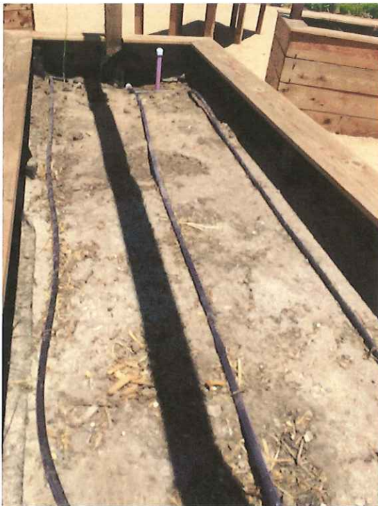
Verified the placement of soil/compost mix at planter boxes. Hose bib connection verified.