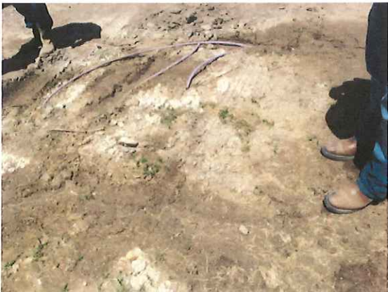
Irrigation drip-lines have been left exposed by county crews during the excavation of plumbing lines due to problems w/ sewage backing-up / unconnected lines of the CRC project.