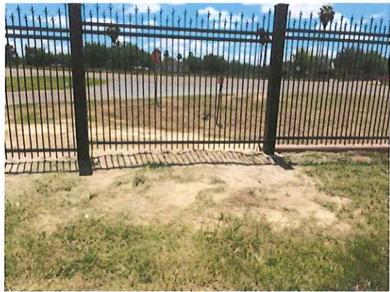
Grading near the intersection of Hwy 107 and Sunflower Road had been modified by county crews during the installation of the perimeter fencing, creating an area of water retention.