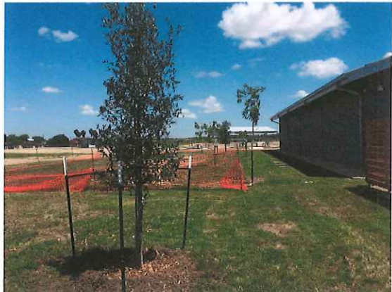
Dead tree at southwest corner of project has been replaced.