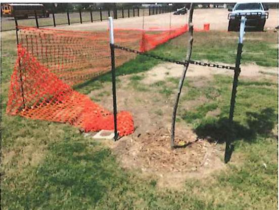
Grass removed | scraped-off during the excavation of the plumbing lines by county crews. Landscaper will not need to replace the grass.