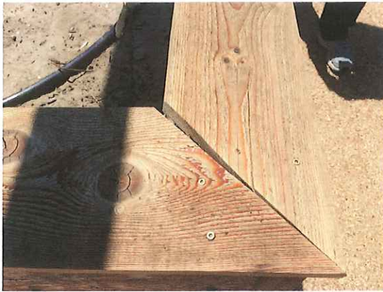
Landscafer to remove and replace boards at two locations.