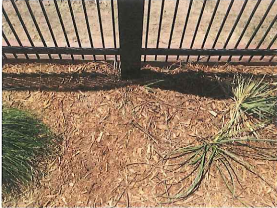
Plants were trampled during the installation of the perimeter wrought iron fencing by county crews. Landscaper will maintain, but not replace, during the next 30 days.