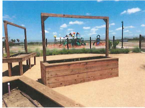
Contractor stated that the cable supports for vines were not installed per the owner's direction. Verification has been requested.