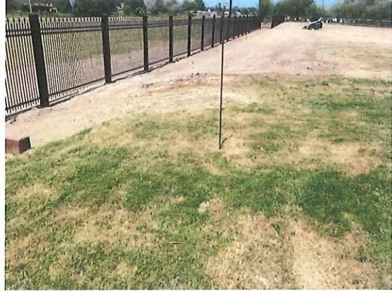
Sections of grass were scraped-off during the grading of of the property toward the perimeter fencing by county Crews. These sections will not be replaced.