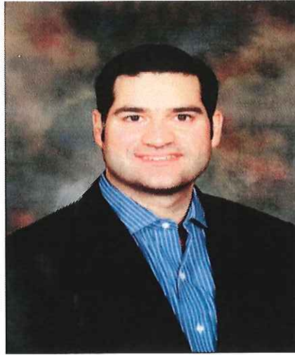
Attorney at Law Hidalgo County, Texas