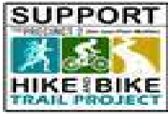
image009.jpg 3 KB