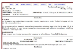
image001.jpg 62 KB