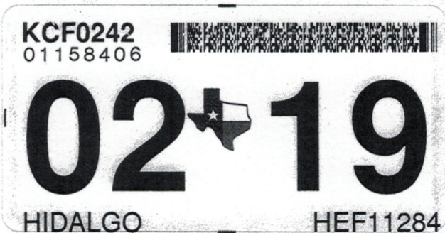
WINDSHIELD STICKER CALCOMANIA DE PARABRISAS

PEEL FROM BACK ONLY / DESPEGUE POR DETRÁS