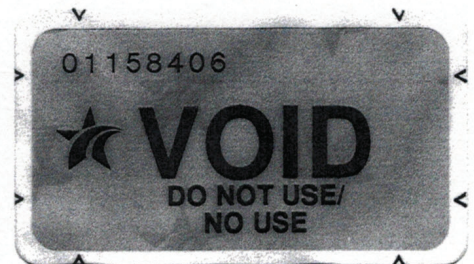
PLATE STICKER CALCOMANIA DE PLACA

Peel sticker from any corner. Despegue la calcomanía de cualquier esquina