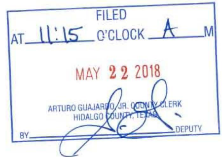
EXHIBIT E -Work Authorization