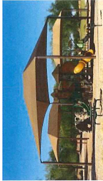
Standard Hip Structure

*Pricing is for materials/delivery only. Installation is not included unless priced above. *If not priced above and if required, the following items and associated costs/fees will be the responsibility of the customer: Sealed Drawings, Building Permits, Payment/Performance Bonds, TDLR Registration/Review/Inspections. *Prices are valid for 30 days after which they are subject to change. Any work not specifically mentioned in this proposal as being included shall be considered excluded. The customer will be responsible for any taxes owed. *Standard Terms: 50% Down Payment with signed proposal; Purchase Orders accepted from municipalities/schools