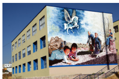
Sample 1.JPG 5 MB