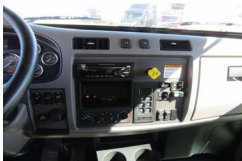
IMG_1238.jpg 92 KB