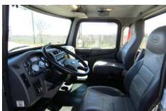
IMG_1236.jpg 98 KB