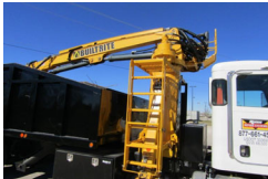
IMG_1233.jpg 100 KB