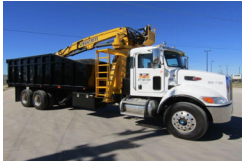
IMG_1228.jpg 91 KB