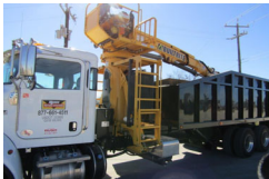
IMG_1234.jpg 99 KB