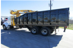
IMG_1224.jpg 88 KB