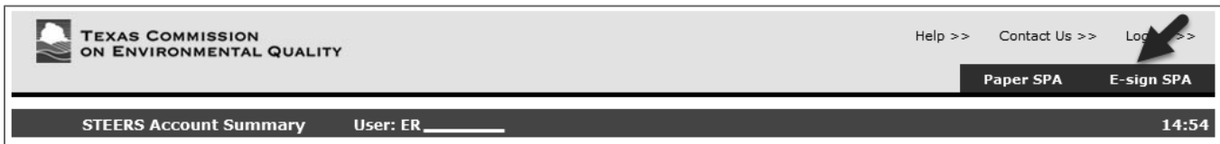
Figure 57: Example of a STEERS Account Summary page header after creating a new STEERS Account