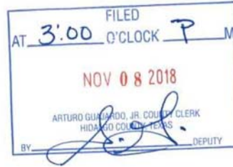
EXHIBIT E -Work Authorization