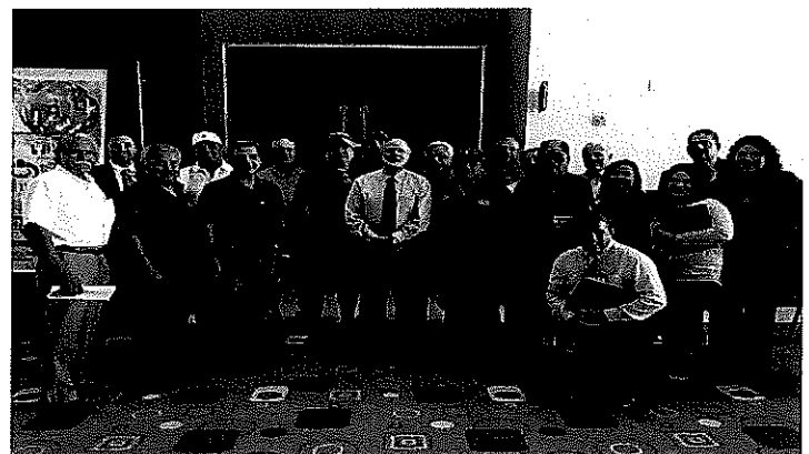
Veterans Health Fair Community Planning Group

Raffle Tickets: All veterans will receive a raffle ticket when signing in for a drawing of gifts donated by local individuals and organizations that support our veterans in the South Texas.