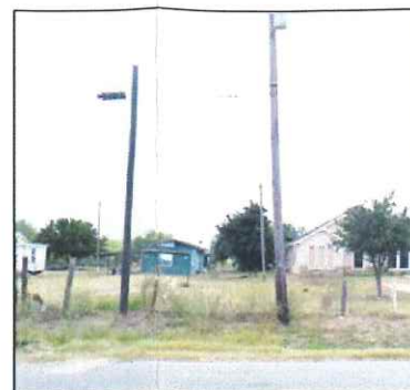
LAT: 26.360758 LONG: -98.112009 NEW PROPOSED SPECTRUM POLE 2' FROM ROW 18' EOP

NOTE: NEW PROPOSED SPECTRUM POLE INSTALLED APPROX. 300' EAST OF INTERSECTION E. RAMSEYER RD AND EARTH DR ON THE SOUTH SIDE OF RAMSEYER RD 2' IN ROW IN FRONT OF ADDRESS 3522 E. RAMSEYER RD.