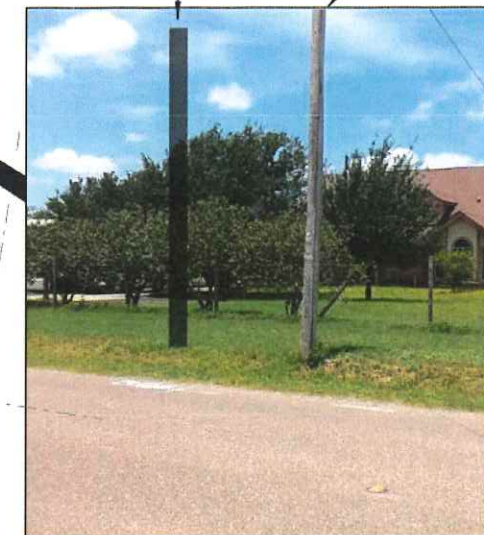
NEW PROPOSED SPECTRUM POLE

MIRELES JESUS EMLIO 6122 RUTH ST PROP ID#590604 LEAGAL DESCRIPTION: BRUSHLINE COUNTRY ESTATES LOT 2