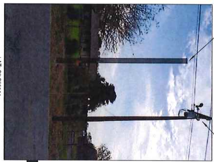
NEW PROPOSED SPECTRUM POLE 6' IN ROW & 6' FROM EOP