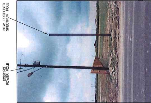
EXISTING POWER POLE

NOTE: NEW PROPOSED SPECTRUM POLE TO BE INSTALLED APPROX 140' SOUTH OF INTERSECTION HUALAHUISE ST & GALEANA ST ON THE EAST SIDE OF HUALAHUISE ST, 10' SOUTH OF EXISTING POWER POLE. PERMITS FOR THE AT ADDRESS (LOT-61) 3290 HUALAHUISE ST.