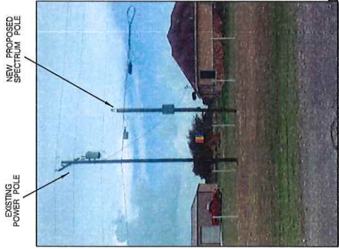
LAT: 26.345782 - LONG: -98.054736 NEW PROPOSED SPECTRUM POLE 2' IN ROW & 38' FROM EOP

NOTE: NEW PROPOSED SPECTRUM POLE TO BE LOCATED ON THE EAST SIDE OF VAL VERDE RD AT INTERSECTION DAVIS RD & VAL VERDE RD ON THE SOUTH SIDE OF DAVIS RD. 10' WEST OF EXISTING POWER POLE. 2' IN ROW & 38' FROM EOP AT ADDRESS 22432 VAL VERDE RD.