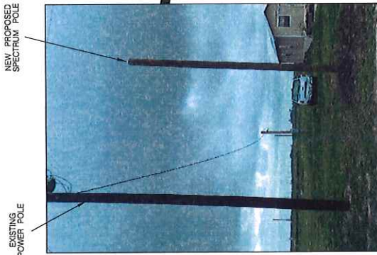
LAT: 25.249826 - LONG: -98.055683 NEW PROPOSED SPECTRUM POLE 2' IN ROW & 8' FROM EOP

NOTE: NEW PROPOSED SPECTRUM POLE IS INSTALLED APPROX 244' NORTH OF INTERSECTION EMILY RD & TRENTON RD ON THE WEST SIDE OF EMILY RD 10' NORTH OF EXISTING POWER POLE. (LOT #1) 9709 EMILY RD. AT ADDRESS (LOT #1) 9709 EMILY RD.