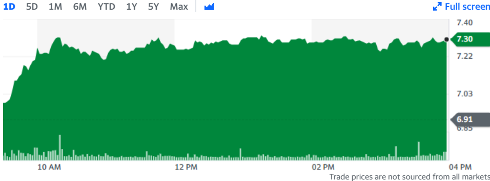
Chart Events ? +