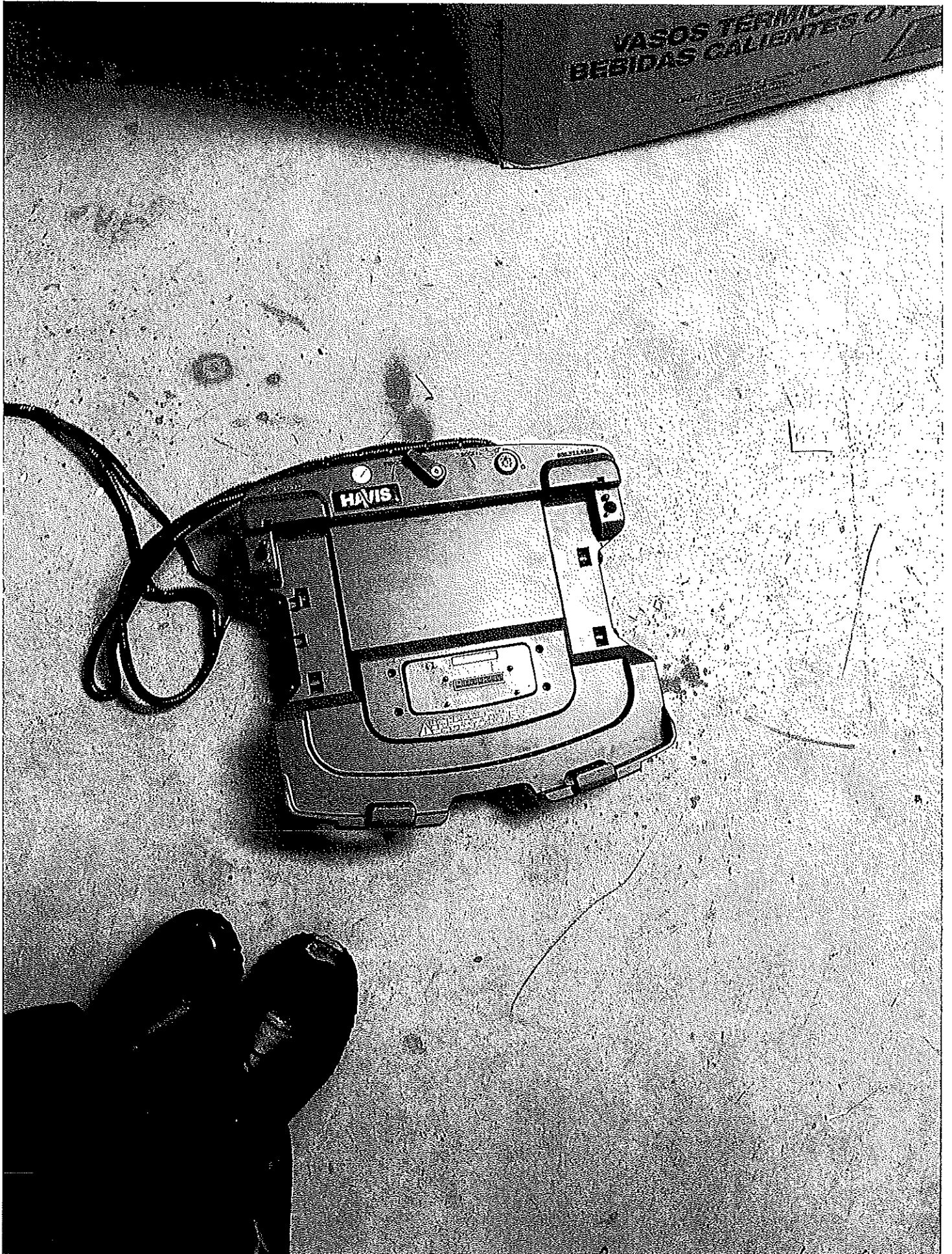
HAVIS Lab Top Holder (model 1000)