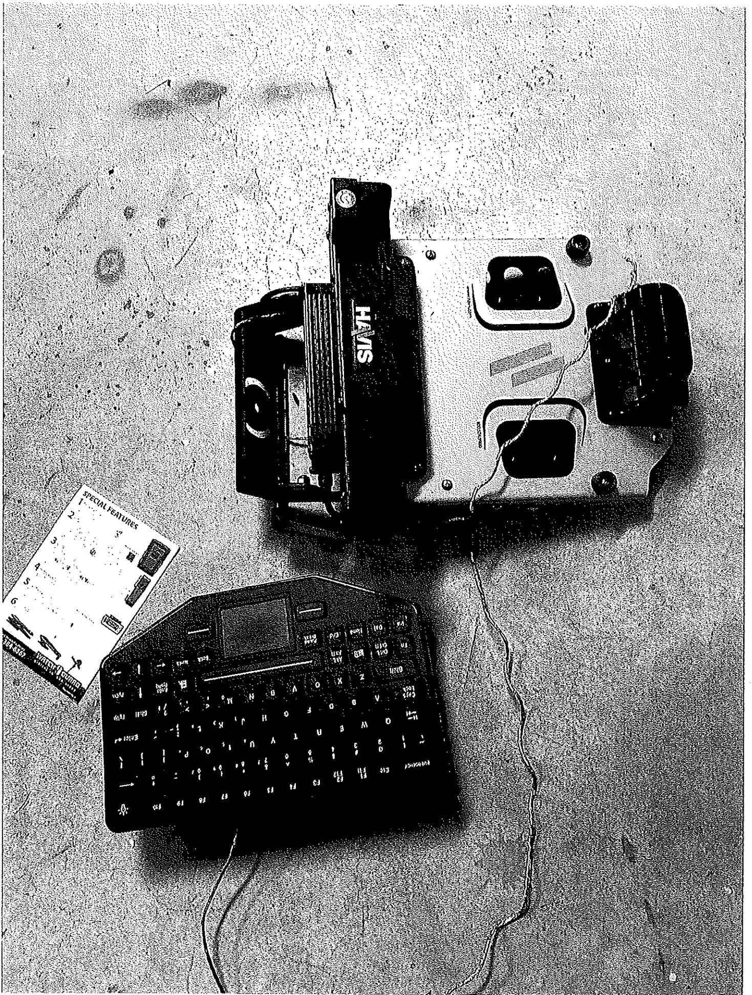
LPO for bracket + Key Board