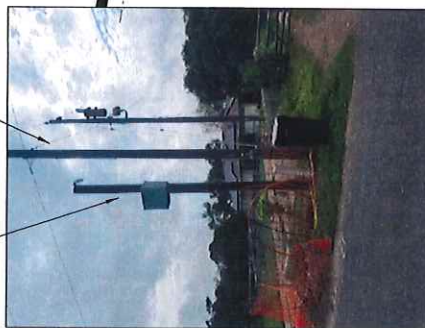
EXISTING POWER POLE NEW PROPOSED SPECTRUM POLE

NOTE: NEW PROPOSED SPECTRUM POLE INSTALLED ON THE EAST SIDE OF N MINNESOTA RD. 5' NORTH OF EXISTING POWER POLE. 8' IN ROW & 7' FROM EOP @ ADDRESS 9160 N MINNESOTA RD.