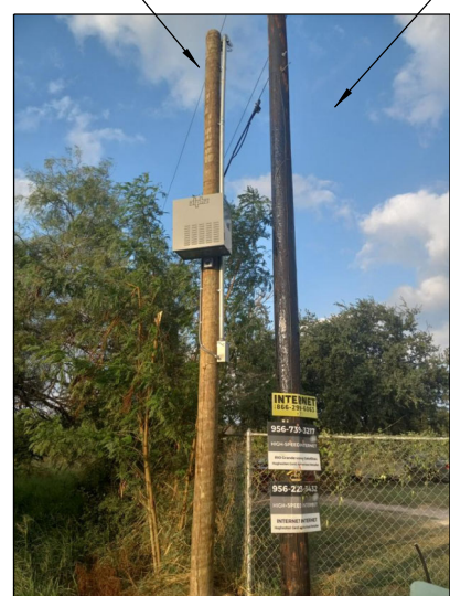
LAT: 26.362645 LONG: -98.301355 NEW PROPOSED SPECTRUM POLE 2' IN ROW & 10.5' FROM EOP