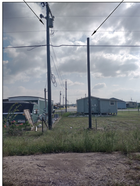
LAT: 26.375839 LONG: -98.107183 NEW PROPOSED SPECTRUM POLE 2' IN ROW BEHIND ADDRESS 7815

EXISTING POWER POLE NEW PROPOSED SPECTRUM POLE