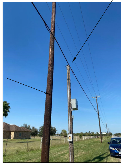
EXISTING POWER POLE

VALLE HORACIO & LIZETTE 6707 E CANTON RD PROP ID#694889 LEGAL DESCRIPTION: BERNY ESTATES UT 2 LOT 2