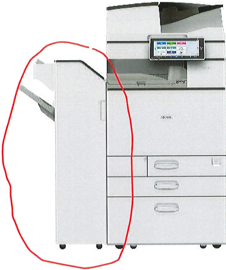
Current configuration 1,000 Sheet External Finisher