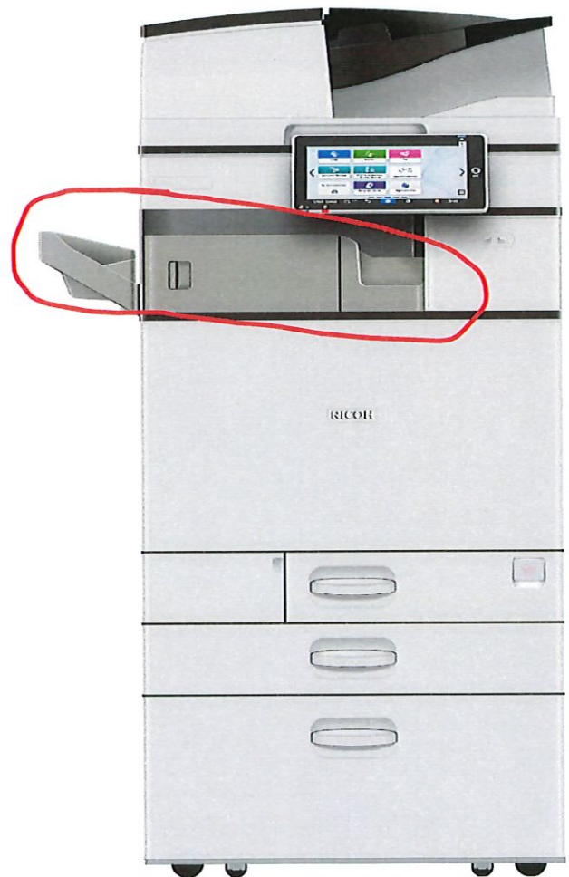
Alternate configuration 500 Sheet Internal Finisher