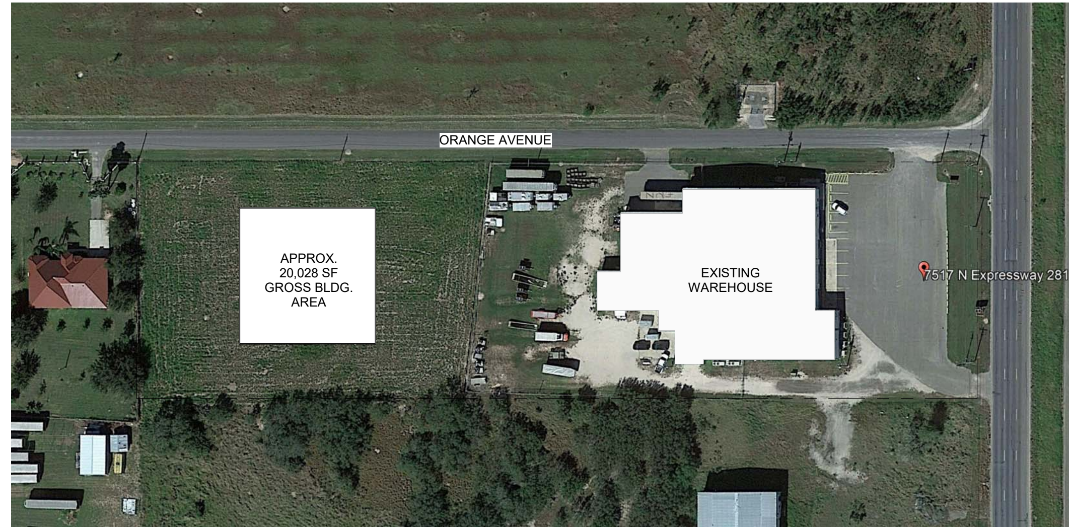
2 PROPOSED SITE PLAN 1" = 100'-0"