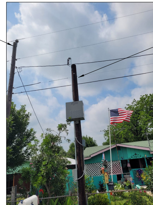
LAT: 26.373454 LONG: -97.967224 NEW PROPOSED SPECTRUM POLE 2' IN ROW & 8' FROM EOP