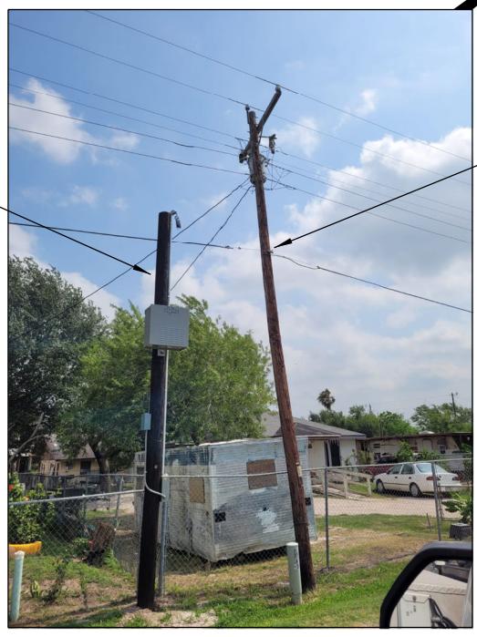
LAT: 26.369748 LONG: -97.965991 NEW PROPOSED SPECTRUM POLE 2' IN ROW & 8' FROM EOP