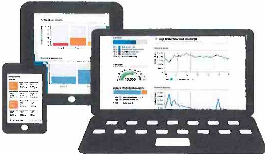
Figure 0-1: MyView Portal offers real-time, role-based access to critical system and services information.

Supplementing Motorola Solutions' proposed services plan for the Detention Center is access to MyView Portal, the Motorola Solutions' online system information tool (see the figure titled "MyView Portal"). MyView Portal provides our customers with real-time visibility to critical system and services information, all through an easy-to-use, graphical interface. With just a few clicks, the Detention Center's administrators will gain instant access to system and support compliance, case reporting, ability to update and create cases, have visibility to when the system will be updated, and receive pro-active notifications regarding system updates. Available 24x7x365 from any web-enabled device, the information provided by MyView will be based on your needs and user access permissions, ensuring that the information displayed is secure and pertinent to your operations.