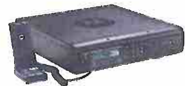
APX All-Band Consolette

The APX All-Band Consolette provides a low-cost, mid-power wireless dispatch solution as an ideal complement to a modern P25 dispatch center. Equipped with leading edge P25 Phase 2 TDMA technology and multi-band interoperability, the APX All-Band Consolette can also be used as an emergency backup station when infrastructure is