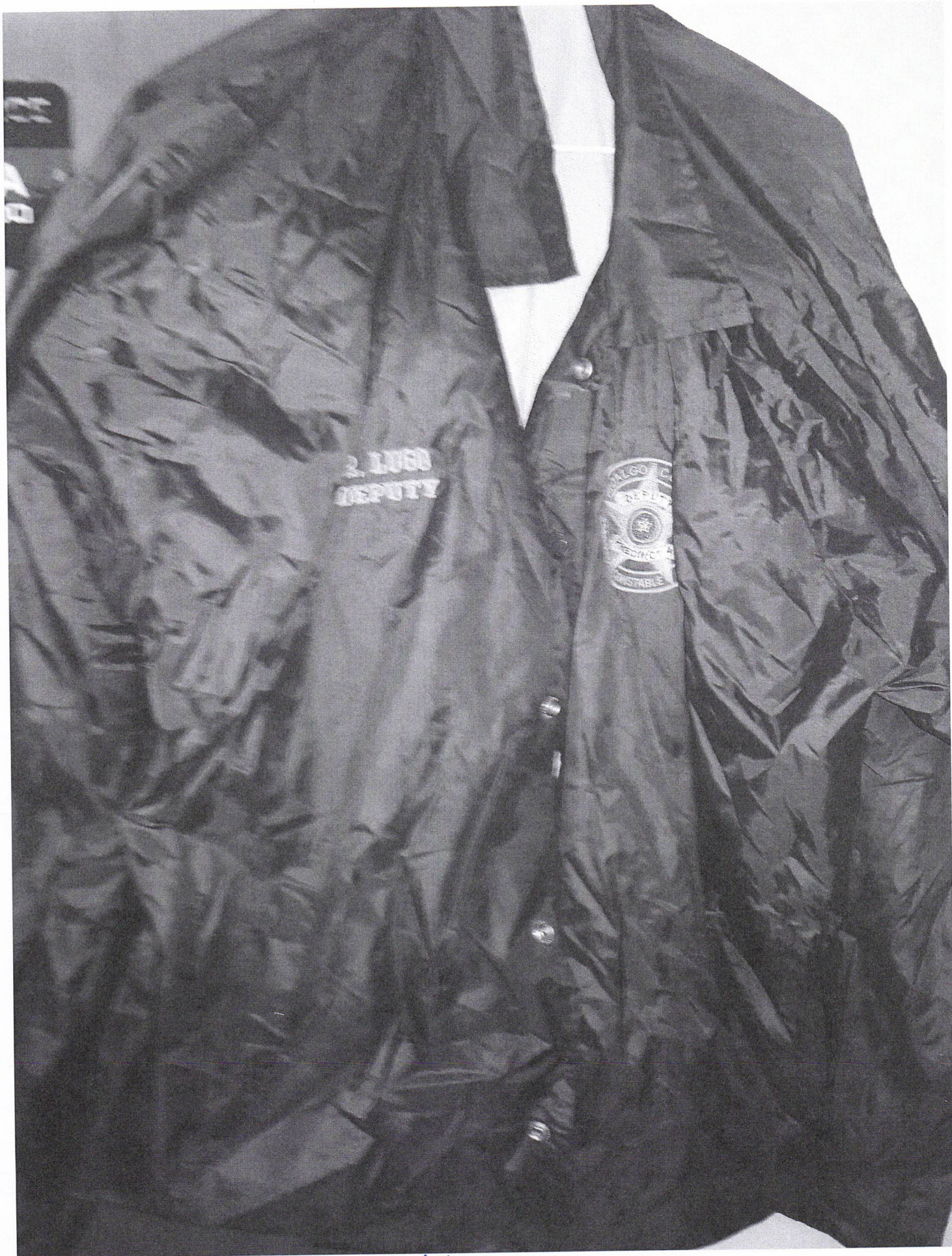
Wind Breaker x1