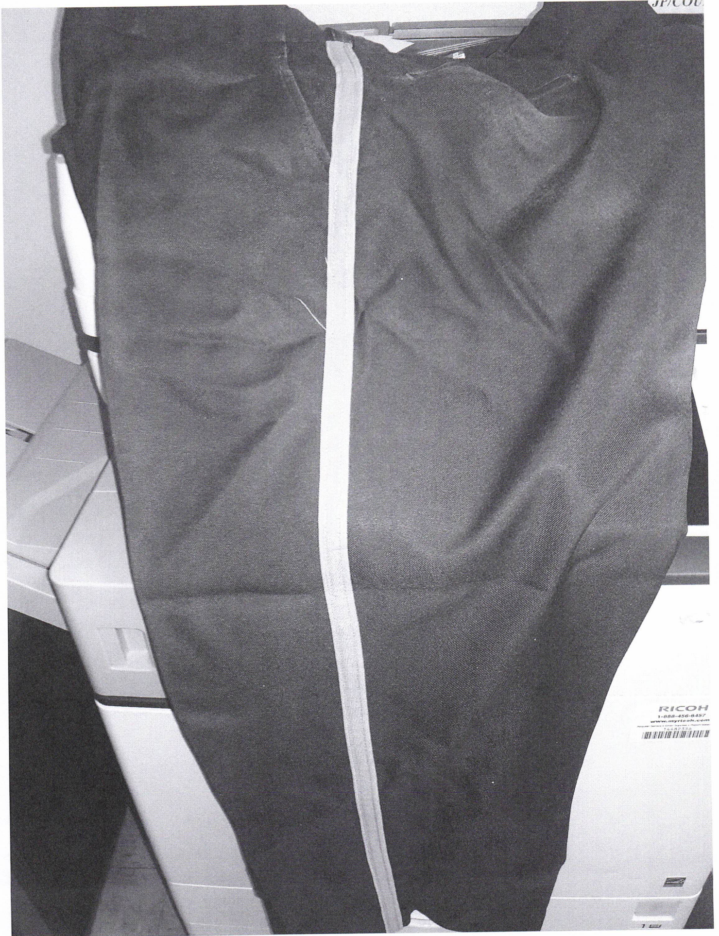
Class A Pants x 13