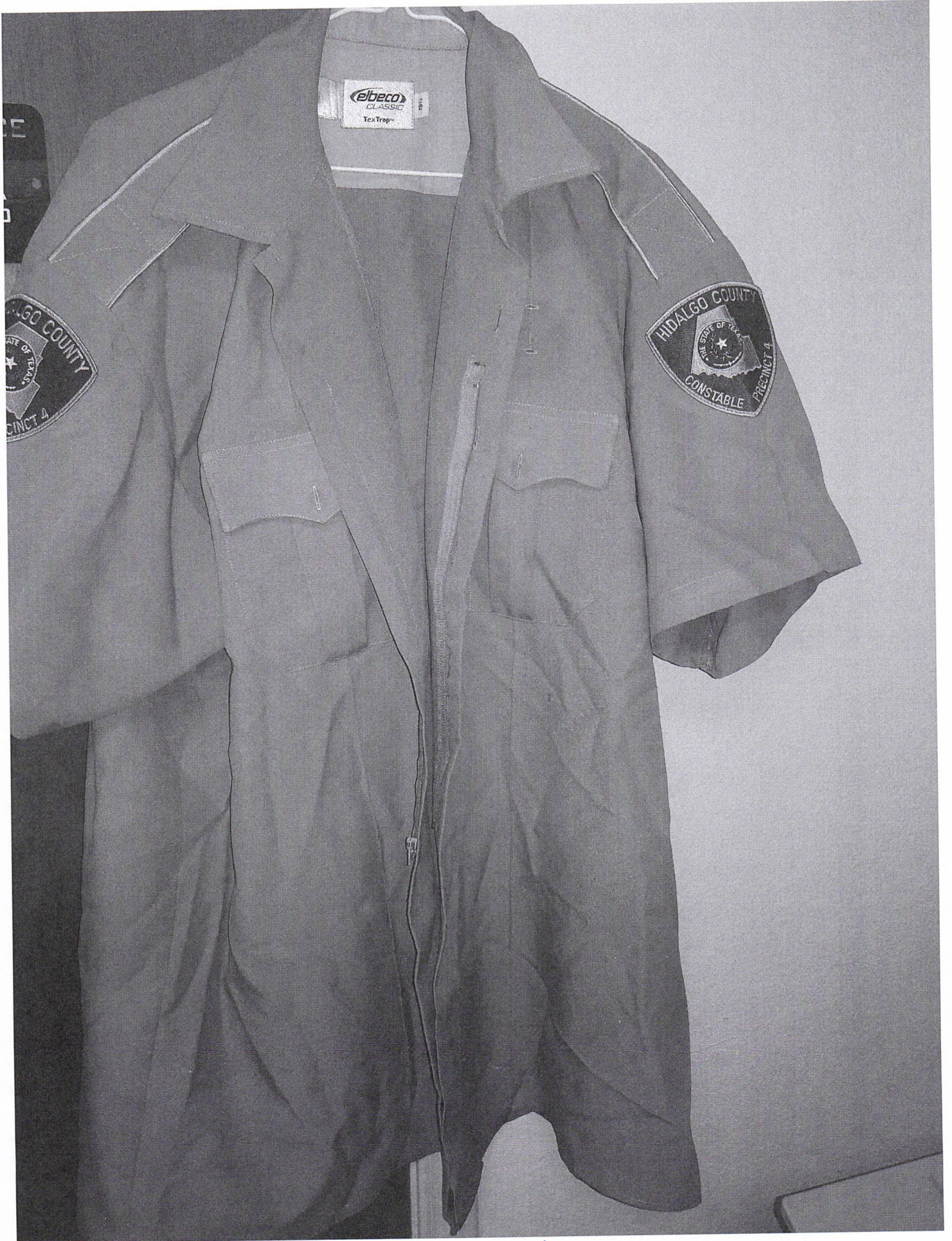
Class B short sleeve x2