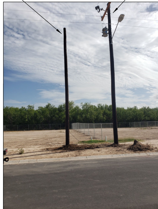
LAT: 26.339185 LONG: -98.108801 NEW PROPOSED SPECTRUM POLE 2' IN ROW & 8' FROM EOP

NEW PROPOSED SPECTRUM POLE EXISTING POWER POLE