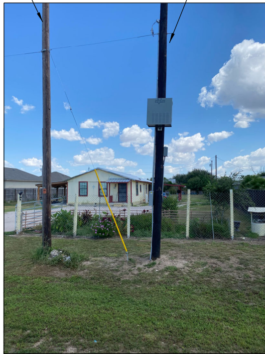
LAT: 26.325174 LONG: -98.050657 NEW PROPOSED SPECTRUM POLE 10' IN ROW & 20' FROM EOP

EXISTING POWER POLE NEW PROPOSED SPECTRUM POLE