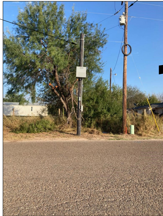
LAT: 26.308073 LONG: -98.318290 NEW PROPOSED SPECTRUM POLE 2' IN ROW & 8' FROM EOP

NOTE: THE INFORMATION AND GRAPHICS DEPICTED ON THIS SHEET HAVE BEEN PLOTTED FROM AVAILABLE RECORDS AND FIELD OBSERVATIONS BUT ARE NOT NECESSARILY EXACT. IT IS THE EXCAVATOR'S RESPONSIBILITY TO VERIFY AND FIELD LOCATE ALL UNDERGROUND OBSTRUCTIONS AND UTILITIES PRIOR TO EXCAVATION. COMPLETE REPAIR OF ANY AND ALL DAMAGES INCURRED SHALL BE AT THE EXPENSE OF THE EXCAVATOR.