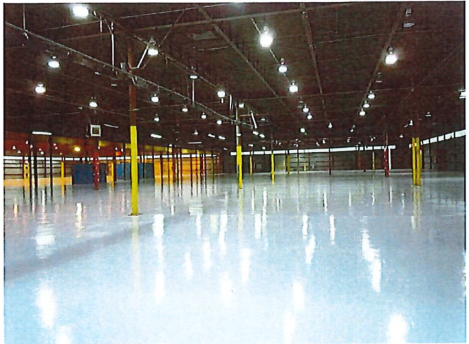
Warehouse with Beams