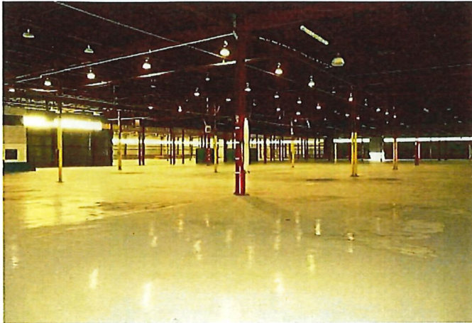
Warehouse with Beams