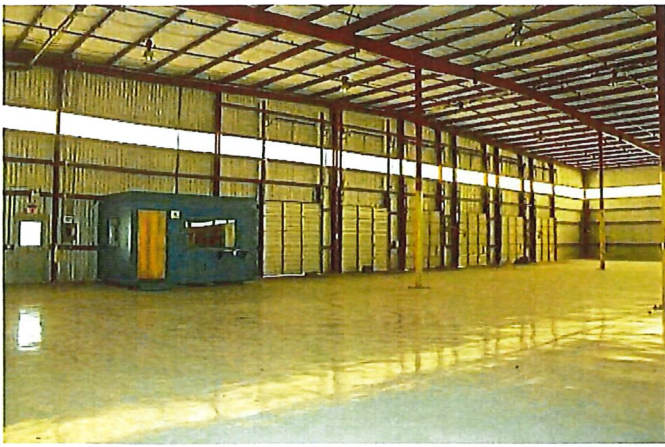
Warehouse with Sliding Doors