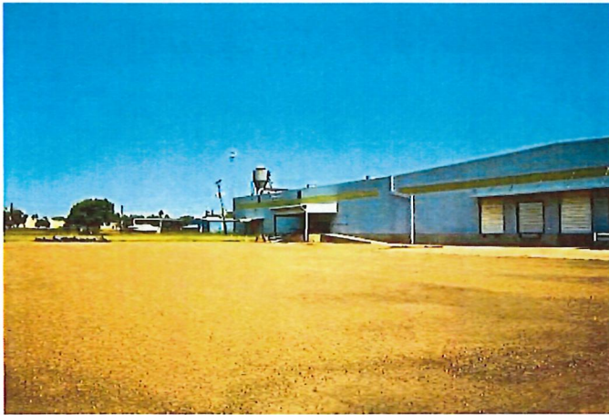
Exterior with Parking Lot