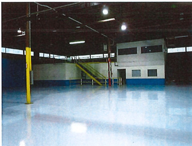
Warehouse with Mezzanine