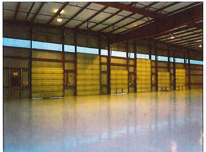
Interior of Docks