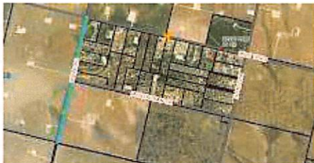
WARE RD EXTENSION.JPG 187K