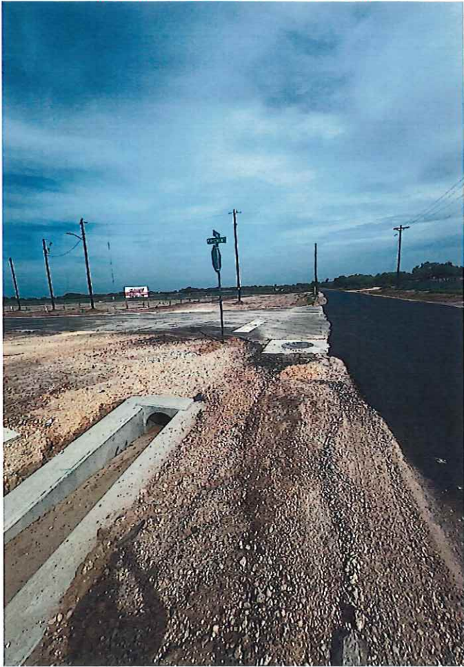
EAST VIEW ELDORA RD