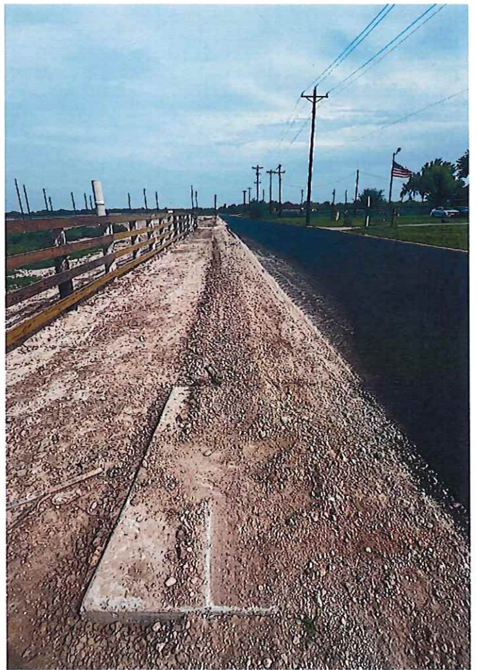
EAST VIEW EL DORA RD