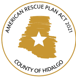
Exhibit A - Projects