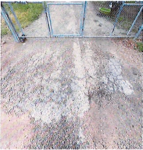
# 6 7604 Tex Mex