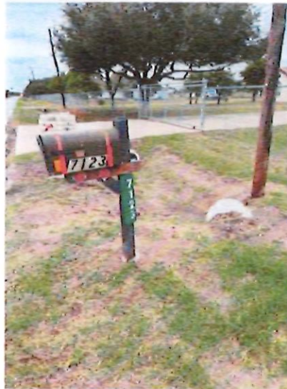
# 5 7123 Tex Mex Resident

Rene Guerra & Son Hauling LLC 12205 N FM 88 STE D Weslaco TX 78596 Ph: (956) 200-6670 Reneguerra.sons@gmail.com