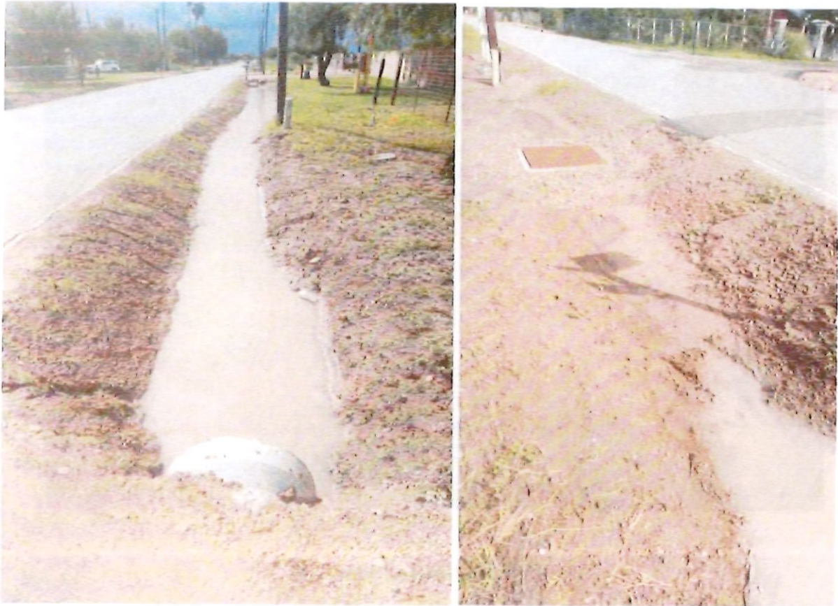
# 4 Bar Ditch 30 + 38

Rene Guerra & Son Hauling LLC 12205 N FM 88 STE D Weslaco TX 78596 Ph: (956) 200-6670 Reneguerra.sons@gmail.com