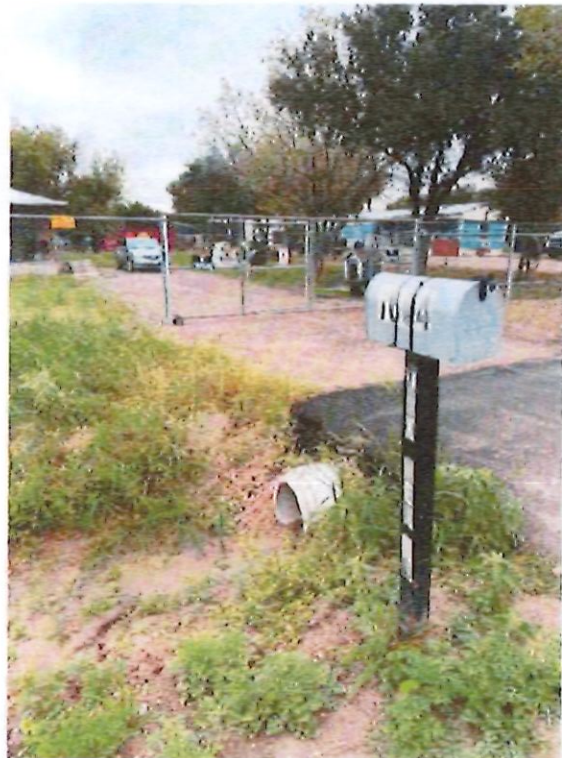
# 6 7604 Tex Mex