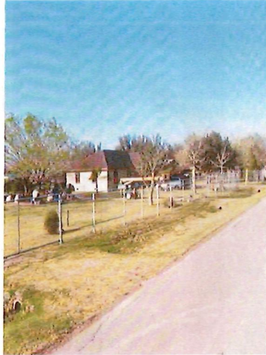
# 3 7706 Tex Mex